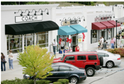
Prime Outlets, Lee

Enjoy breakfast at Current's Restaurant, at the Marriott, and then head northwest to the Prime Outlets in Lee, MA. At Lee, you will find Tommy Hilfiger, COACH, BCBGMAXAZRIA, Calvin Klein, Polo Ralph Lauren and many more outlets. Grab a quick bite in the food court, conveniently located at the Lee Outlets.